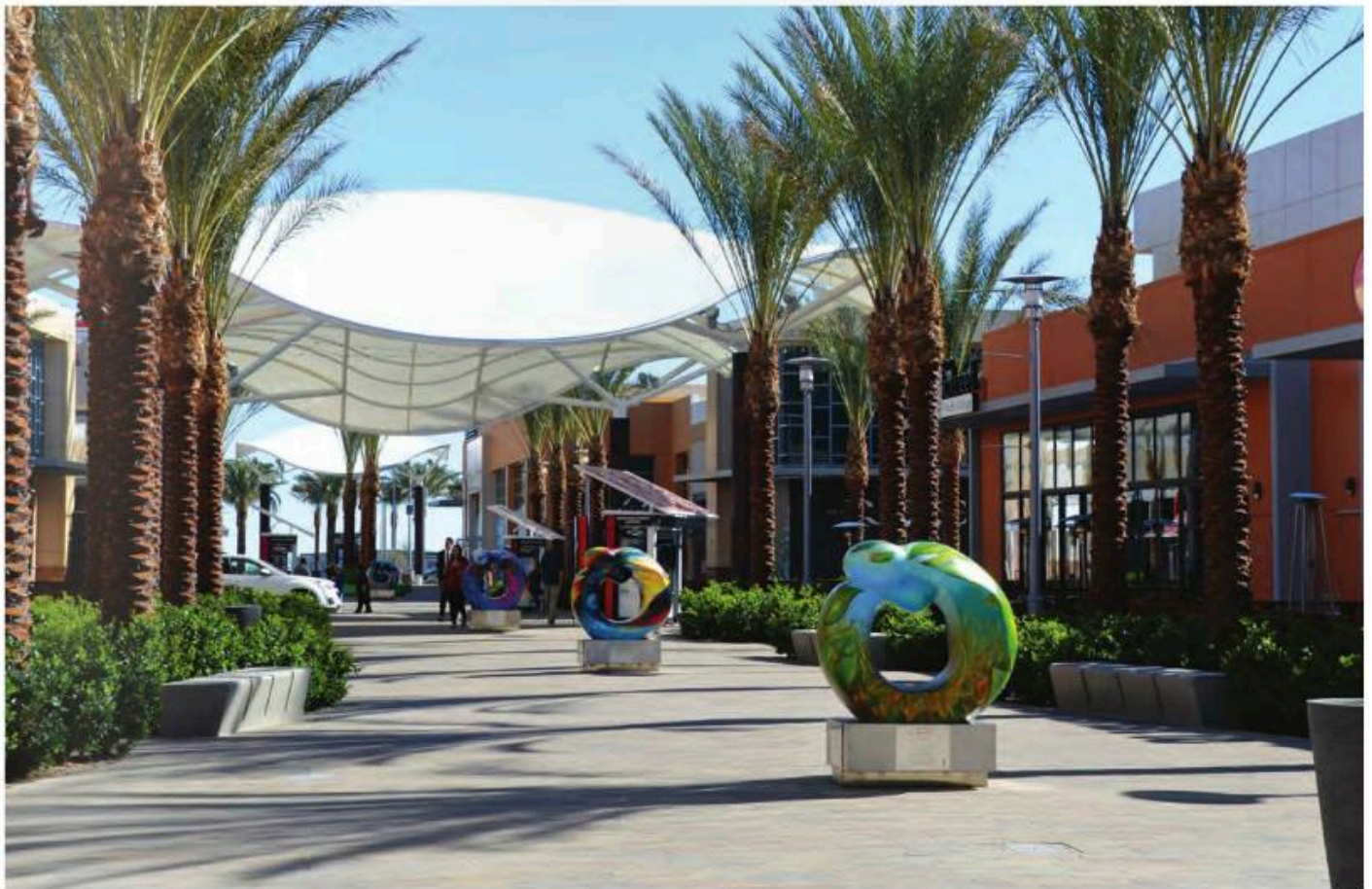
Celebration of Life sculptures enhance the walkways of Downtown Summerlin.

Every downtown has to have a bakery, doesn’t it? Downtown Summerlin does! Wonderland Bakery transports you to a place of happy as soon as you enter its doors and step onto its one-of-a-kind, sparkly floor. With a “Welcome to Wonderland,” the staff