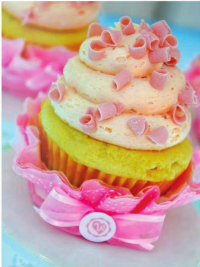
Wonderland Bakery is any girl's fantasy with cupcakes galore!

Downtown Summerlin already has plans to make itself the true downtown of the area. Ideas are already in the works to develop the 200 acres to its east which, according to proposals, will include an amphitheater, residences and a park. It's all part of Downtown Summerlin's strategy to continuously evolve and anticipate its community's wants and needs, eventually transitioning itself into an urban core where one can truly live, work, and play. ■