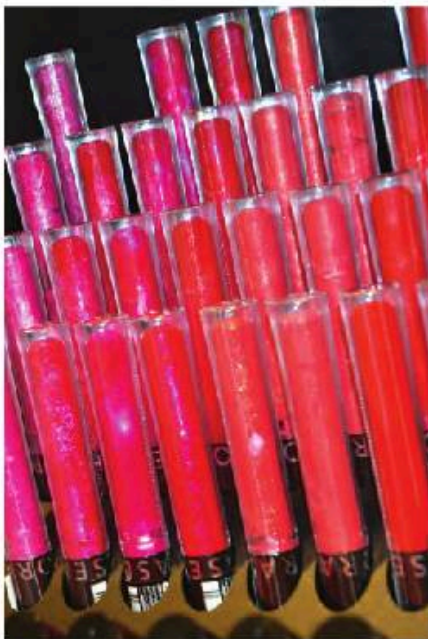
Discover the latest in beauty at Sephora.

Speaking of restaurants, foodies can rejoice. Downtown Summerlin offers everything from Asian to Italian and ice cream to pretzels. There are a lot of firsts in the restaurant offerings, too. Offering a