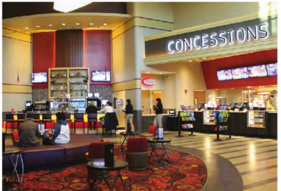
Regal Cinemas is the way to go for a super comfortable movie experience.